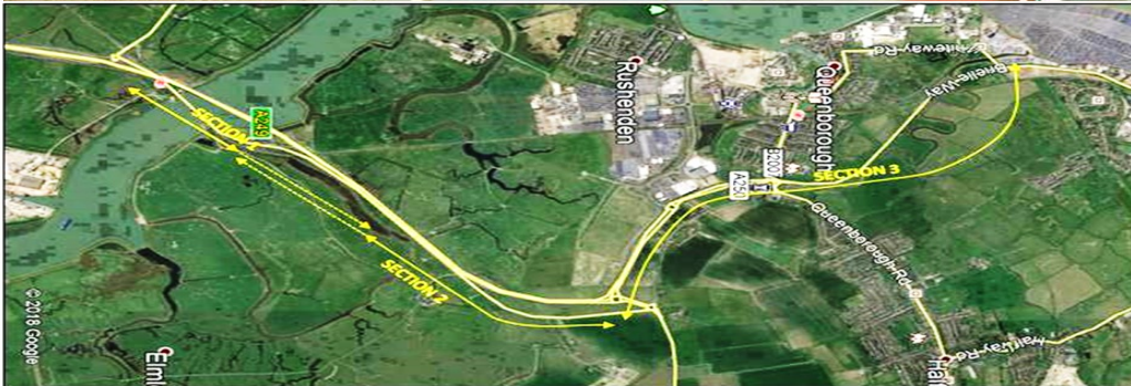
Sheppey Proposed Gas Main Route 6 km and goes under the Swale.