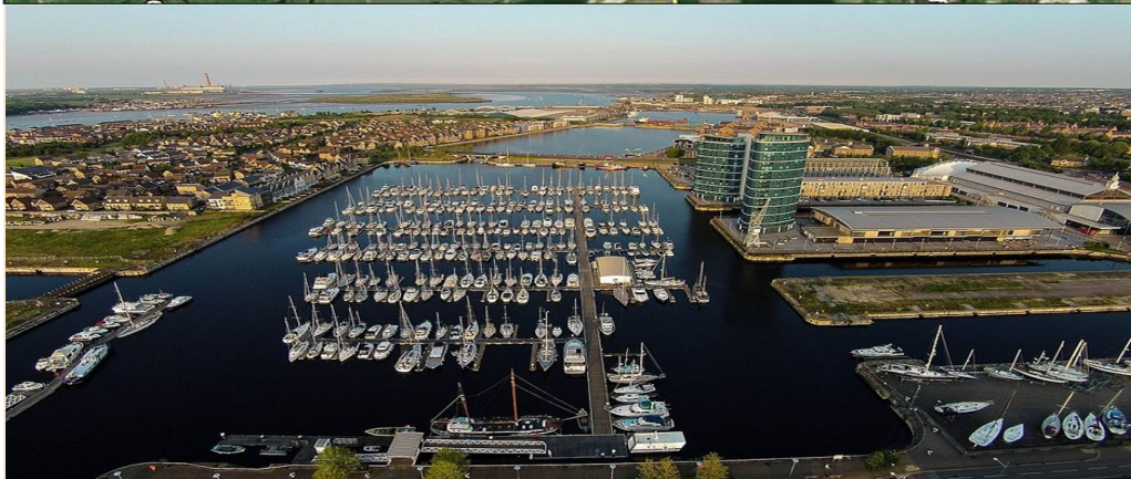
The SGN twin MP main crosses the Chatham dockyard bridge to St Marys Island.